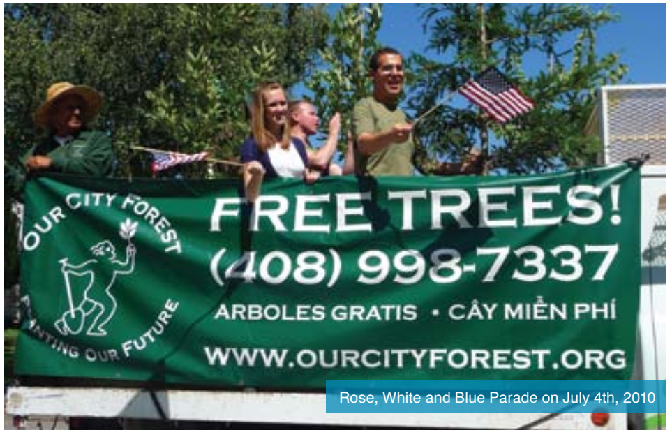
Rose, White and Blue Parade on July 4th, 2010