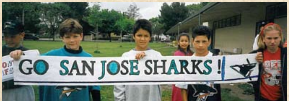
Schallenberger students catch Stanley Cup fever.