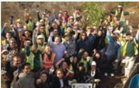
Greening Zanker Road Landfill

NONPROFIT ORG US POSTAGE PAID SAN JOSE CA PERMIT NO. 2292