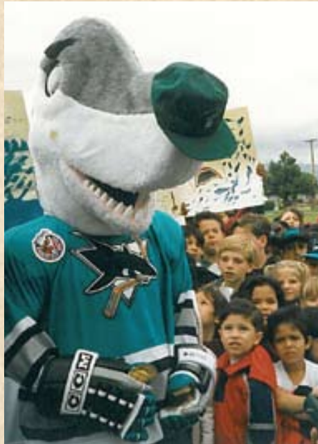
Sharkie, the mascot gets interviewed wearing with his OCF hat.

The San José Sharks and Toronto Maple Leafs reach the Stanley Cup playoff semi-finals. Caught up in the excitement, OCF coordinates an inter-city tree planting with a Toronto tree group. Sharkie , the mascot, joins Schallenberger Elementary students to plant a suitable maple, while back in Toronto, an oak is being planted. Schallenberger students, dressed in teal and black, also learn how maple syrup is made! In spite of the rain, a dozen news reporters from San José to San Francisco make their way to the event and jockey for position for a "live at noon" clip with Sharkie. It's a winner!