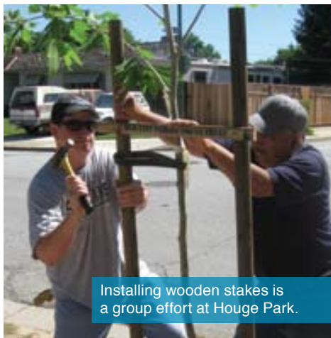
Installing wooden stakes is a group effort at Houge Park.