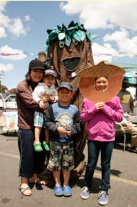
At the Flea Market, a family poses with our tree mascot "O2."

Tree Tours • Ask the Tree Doctor Adopt-an-Oak • Pruning Demos Tree of Fortune • Photos With O2 Face-painting • Tree Toss Game