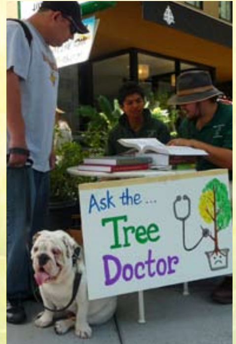
Our City Forest experts are on hand to answer visitors' tree-related questions.