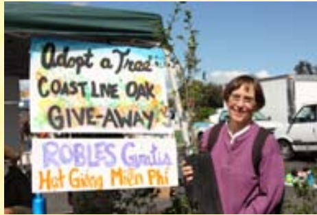
This excited adoptee has agreed to plant and care for her Coast Live Oak seedling.